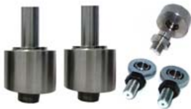
Special tension tools depending of capacity.