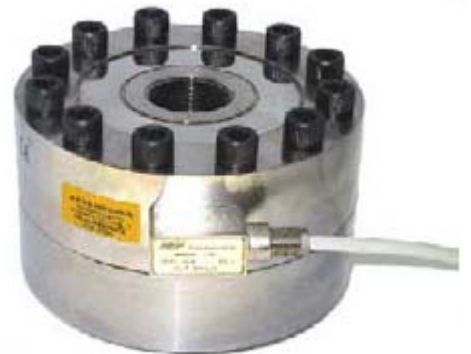
CTC8 ISO376 Class 0.5 Compression, 5kN-1000kN Tension Class 1