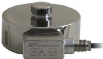
C8S ISO376 Class 1, 5kN - 2000kN, compression.