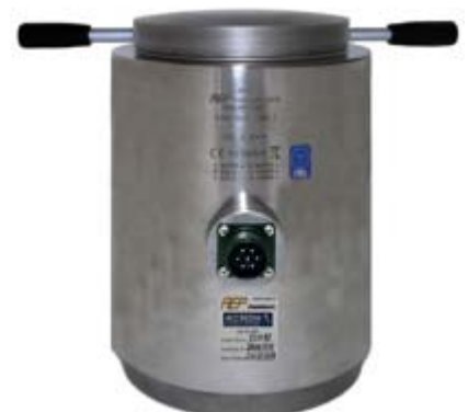
CLSTM ISO376 Class 0.5, 1 from 300kN - 5MN in compression