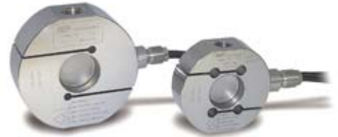
TS-TM ISO376 -- 0.5kN ... 5kN Class 00, 0.5, 1, Tension / Compression