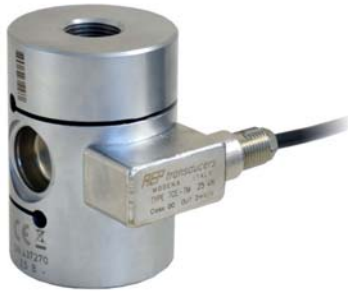
TCE-TM ISO376 5kN....100kN Class 00, 0.5, 1 Tension / Compression