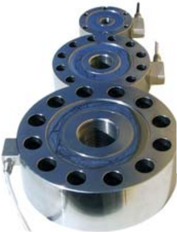
CTC4 ISO376 Class 1 from 5kN to 5MN Compression Tension up to max. 2.5MN