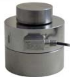
C8S ISO376 Class 0.5, 5kN - 1000kN in compression only when using correct bearing plate.