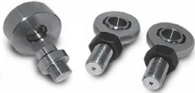
Correct made accessories